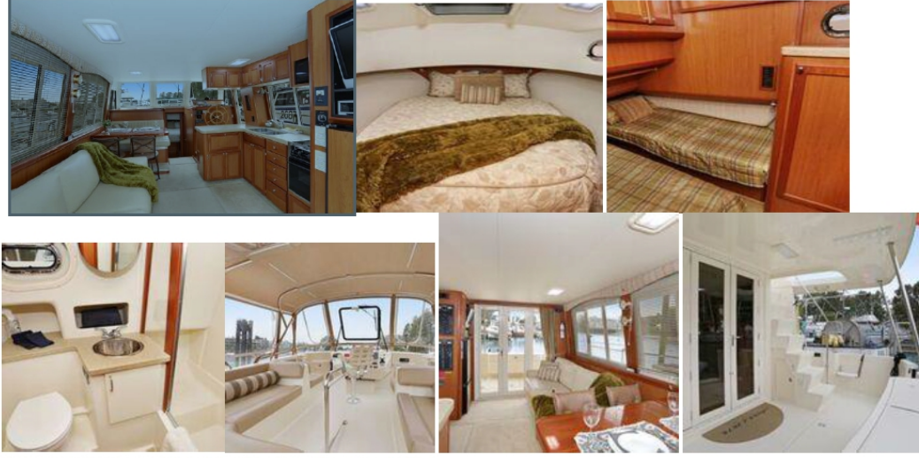
For more pictures and a virtual tour go these websites: <u>https://www.seevirtual360.com/themes/50/flashTheme.aspx?listingID=36690#.WcP8nBRhhUE</u> https://www.dropbox.com/sh/q4vmdzt44scmneg/AACsndRn6HVXyZLEDRzLE4lwa?dl=0

Asking price $249,000 US dollars. Cdn duty paid. Available for viewing in Ladner by appointment only. Call Trevor Brice at 604 377-6650 or toll free at 1 877 564-9989