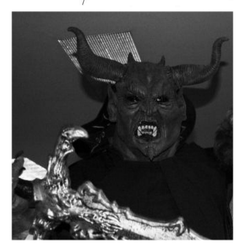
'Best Male costume' = skipper of 'Wild Hare'